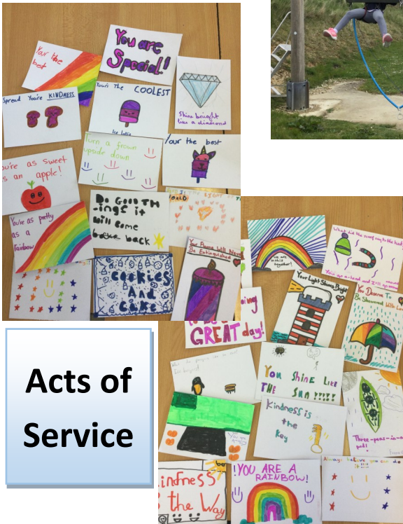
Acts of Service