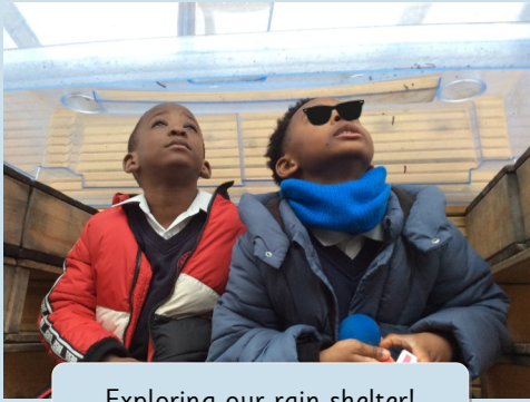
Exploring our rain shelter!