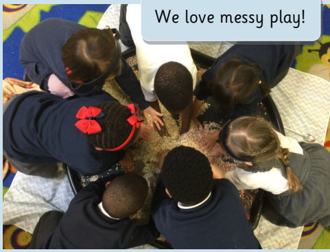
We love messy play!