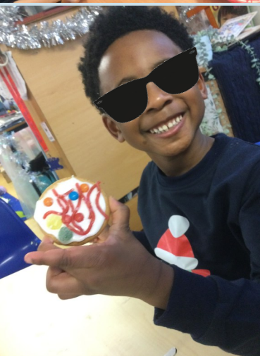
We love cooking!