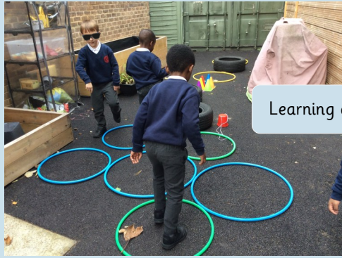
Learning and Playing!