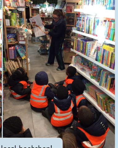
Visiting our local bookshop!